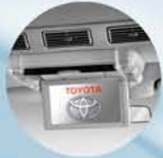
REAR SEAT ENTERTAINMENT (optional)