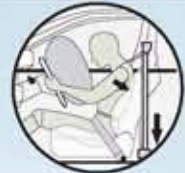
NEW SEATBELT WITH PRETENSIONER AND FORCE LIMITER (all type)