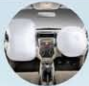
DUAL SRS AIRBAG (all type)