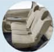
MORE COMFORTABLE NEW SEAT DESIGN (all type)